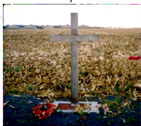
This cross still stands in Belgium as a constant reminder of the WW1 Christmas Truce in December 2014

themselves as enemies but fellow human beings.